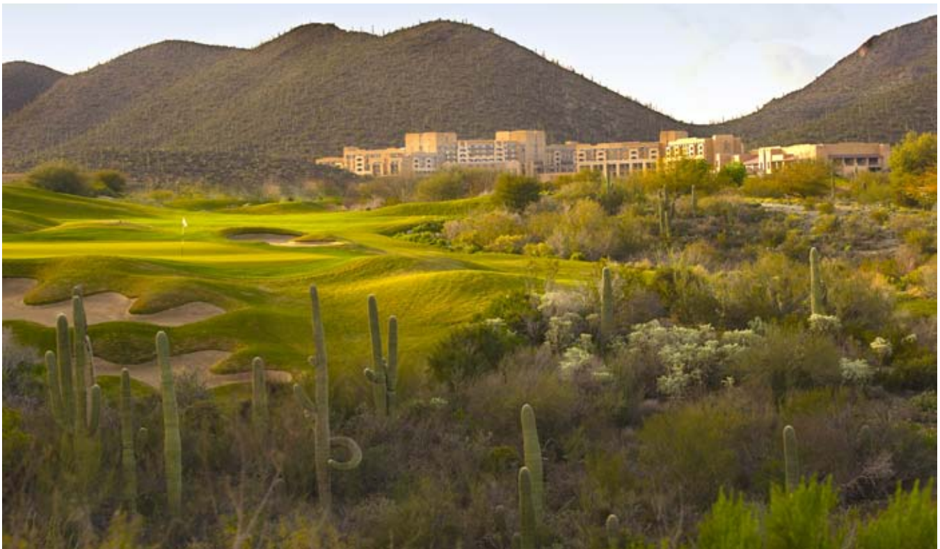
Main Building of the JW Marriott Starr Pass

For many years, the United States offered the greatest degree of inter-institutional student mobility and the most extensive system of portability of academic credit in the world. Despite this lengthy history of facilitating student transfer, many obstacles to seamless transfer persist. Higher education institutions must adopt a student-centered approach, with the goal of creating a transfer-friendly environment to encourage the recruitment, matriculation, enrollment, and eventual graduation of this student demographic.