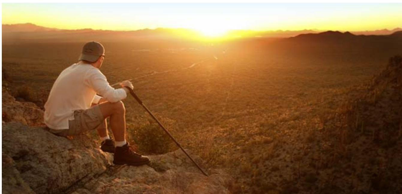
Enjoy the views and scenery while hiking from the JW Marriott Starr Pass