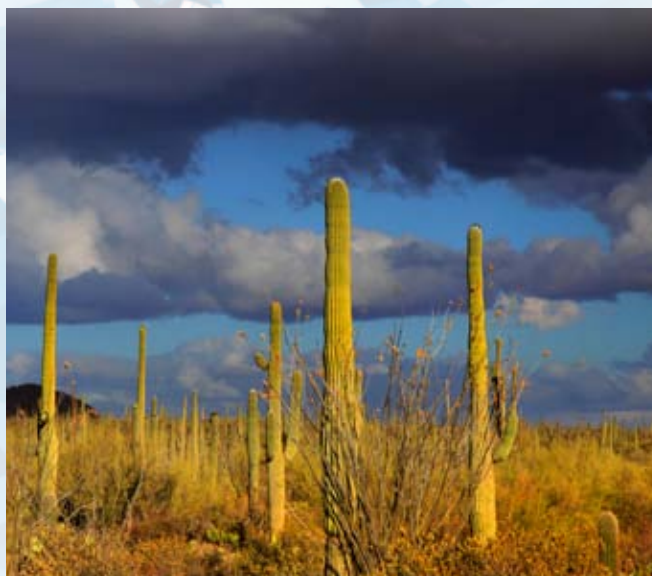
Saguaro national park

AACRAO—IV PO Box 37500 Baltimore, MD 21297-3500