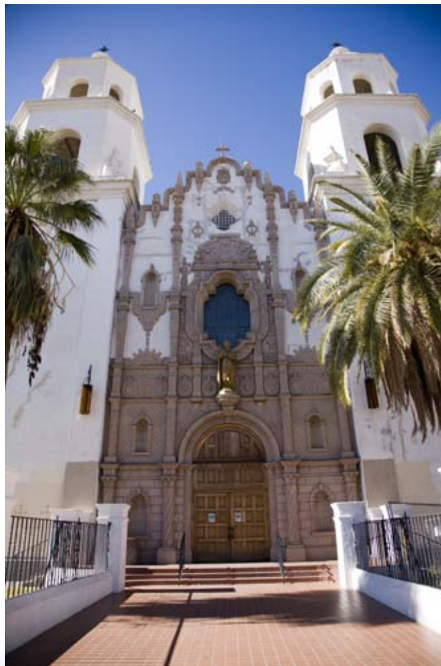
St. Augustine Church in Tucson