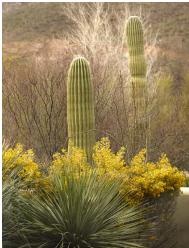
Viewing cactus from the JW Marriott Starr Pass